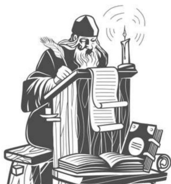
A NOTE FROM PR. ROBB