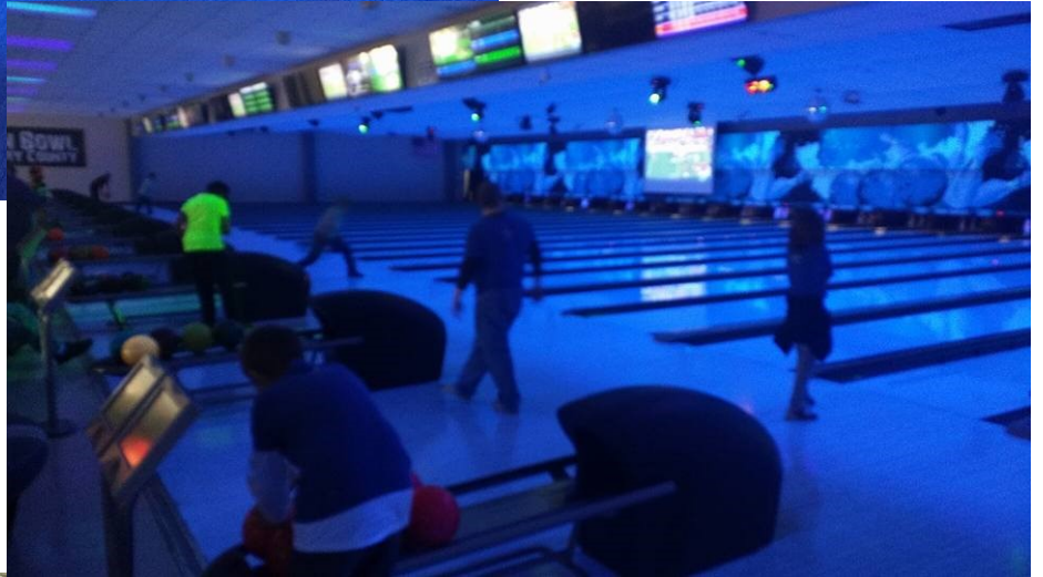
The youth had lunch and went bowling!!!