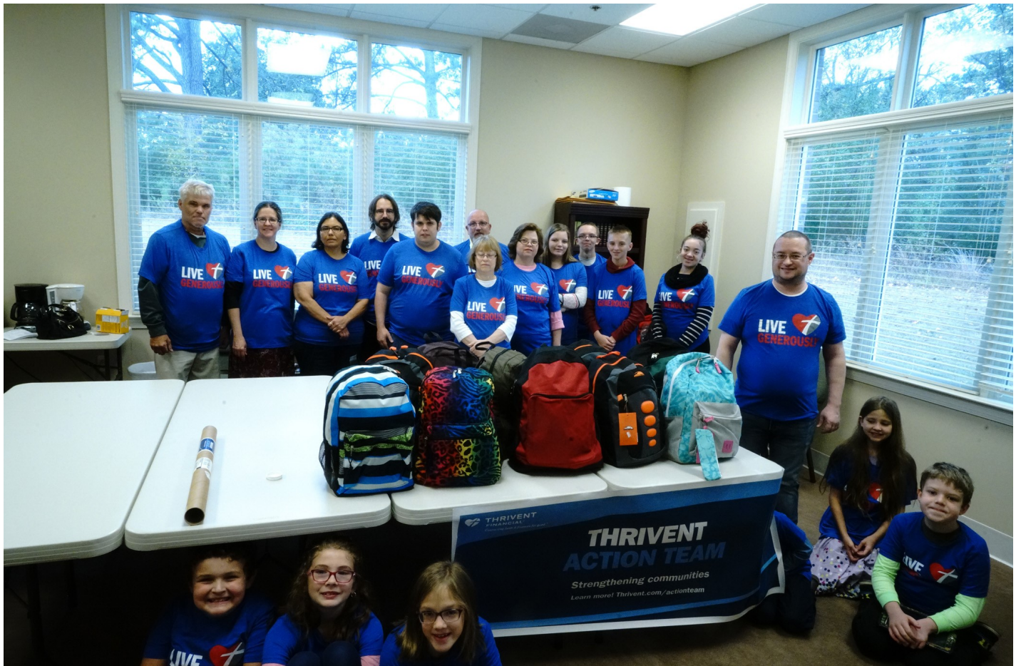
Backpacks and Shoeboxes packed, delivered and mailed!!